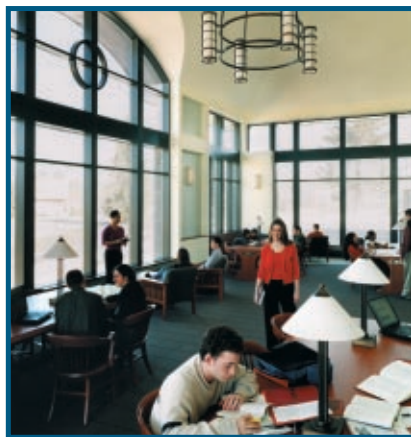
James A. Cannavino Library - Marist College, NY. Model for new academic resource center.

Over the past two years we were able to renovate both A and B buildings with proceeds from our annual fund. We now must improve the learning environment in the C building for our students. These classrooms are in desperate need of new floors, ceilings, and furniture.